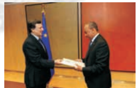
Ambassador presenting credentials to Jose Manuel Barroso, President of the European Commission