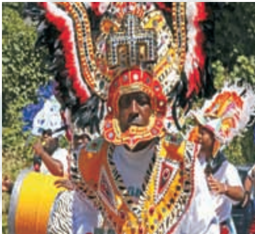
One of the delights of Junkanoo summer: A performer lights up Ryde, Isle of Wight, July 2008

Commission's agenda in 2008, often in close collaboration with The Bahamas Tourist Office, London. The highlight of this effort was undoubtedly the first-ever performance of Junkanoo in the United Kingdom, as members of various Bahamian Junkanoo groups travelled twice to the UK, first in April and then again in July, to perform in the Isle of Wight and at the Henley Festival. The Junkanoo performers also brought some colour and excitement to a dreary July evening on the South Bank with a