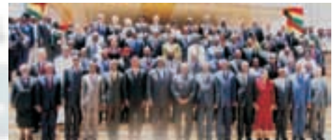
ACP Heads of State and Government