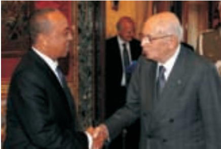
Ambassador and H.E. Giorgio Napolitano