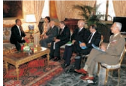
Ambassador meets with the President and his advisors